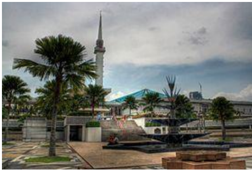
National Mosque (Chinese: 国家清真寺)

The Petronas Towers, also known as the Petronas Twin Towers (Malay: Menara Petronas, or Menara Berkembar Petronas) are twin skyscrapers in Kuala Lumpur, Malaysia. According to the Council on Tall Buildings and Urban Habitat (CTBUH)'s official definition and ranking, they were the tallest buildings in the world from 1998 to 2004 until surpassed by Taipei 101, but they remain the tallest twin building in the world. The buildings are the landmark of Kuala Lumpur with nearby Kuala Lumpur Tower.