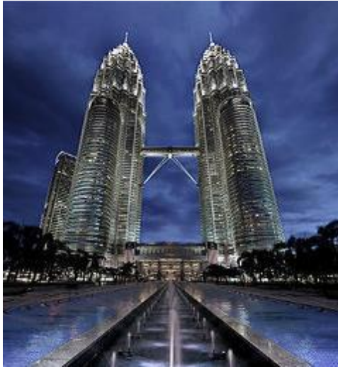
Petronas Twin Towers (Chinese: 双子塔)

The Petronas Towers, also known as the Petronas Twin Towers (Malay: Menara Petronas, or Menara Berkembar Petronas) are twin skyscrapers in Kuala Lumpur, Malaysia. According to the Council on Tall Buildings and Urban Habitat (CTBUH)'s official definition and ranking, they were the tallest buildings in the world from 1998 to 2004 until surpassed by Taipei 101, but they remain the tallest twin building in the world. The buildings are the landmark of Kuala Lumpur with nearby Kuala Lumpur Tower.